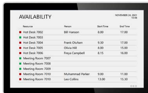
VL800 | 49" Meeting Directory Display