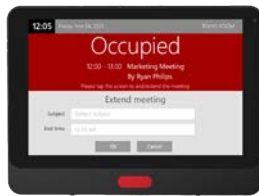
DS-1050 | 10"