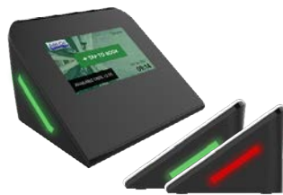
WS-0350 | 4" Workspace Booking Display

We offer a wider selection of displays. See a selection of our desk booking displays and meeting directory displays below.