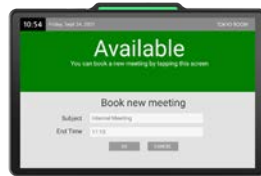
DS-1060 Slim | 10"

We offer a wider selection of displays. See a selection of our desk booking displays and meeting directory displays below.