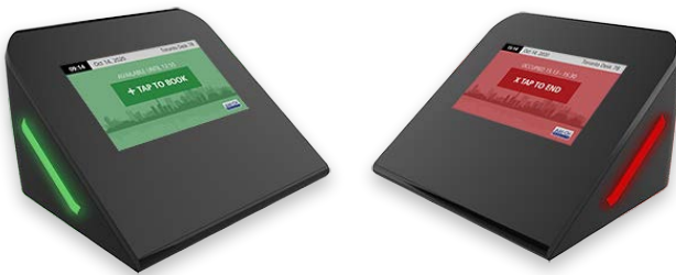
4" Desk Booking Screen | WS-0350