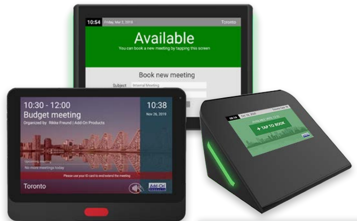
4" Desk Booking Screen | WS-0350