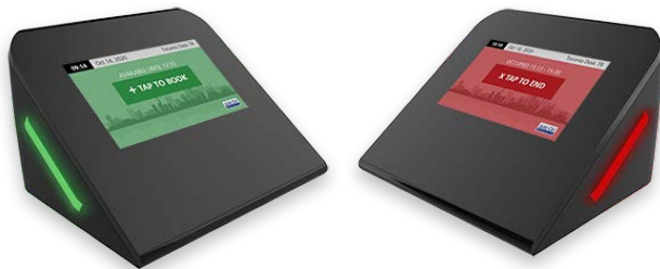
4" Desk Booking Screen | WS-0350